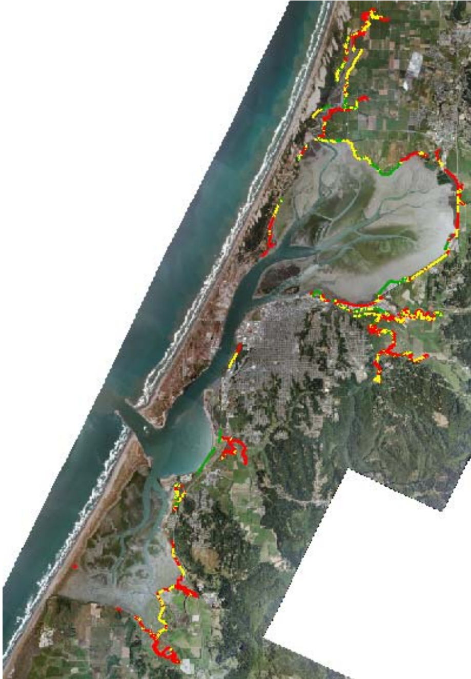
Figure 1. Diked and railroad shoreline vulnerability rating for Humboldt Bay; red-high, yellow-moderate, and green-low.

The total length of diked shoreline that is rated highly vulnerable is 21.0 miles and for railroad shoreline 5.1 miles. Eureka Slough has the greatest length of diked shoreline rated highly vulnerable, 7.13 miles; South Bay 5.1 miles, Mad River Slough 4.4 miles, Elk River Slough 2.7 miles, Arcata Bay 1.5 miles, and Eureka Bay 0.3 miles. Arcata Bay has the greatest length of railroad shoreline rated highly vulnerable, 4.0 miles; South Bay 0.6 miles, Eureka Bay 0.4 miles, Eureka Slough 0.01 miles, and Elk and Mad River Sloughs negligible lengths of railroad bridge ramps that are vulnerable. The distribution of shoreline vulnerability ratings is depicted in Figure 1.