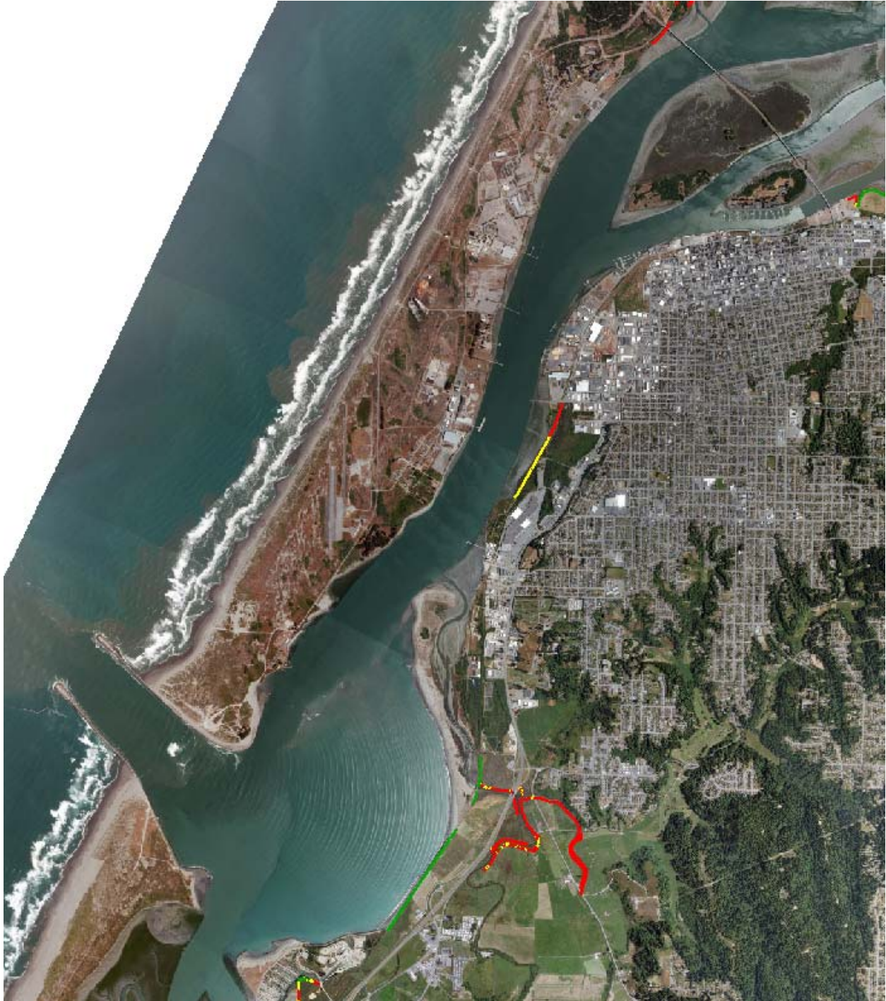
Figure 5. Diked and railroad shoreline vulnerability rating for Eureka Bay; red high, yellow moderate, and green low.