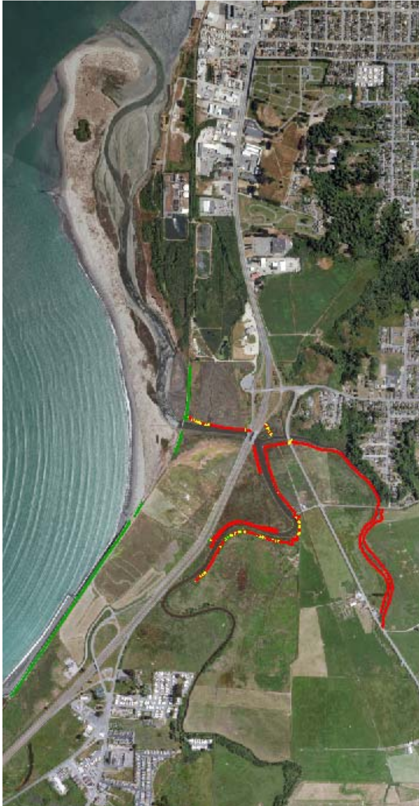
Figure 9. Diked and railroad shoreline vulnerability rating for Elk River Slough; red high, yellow moderate, and green low.