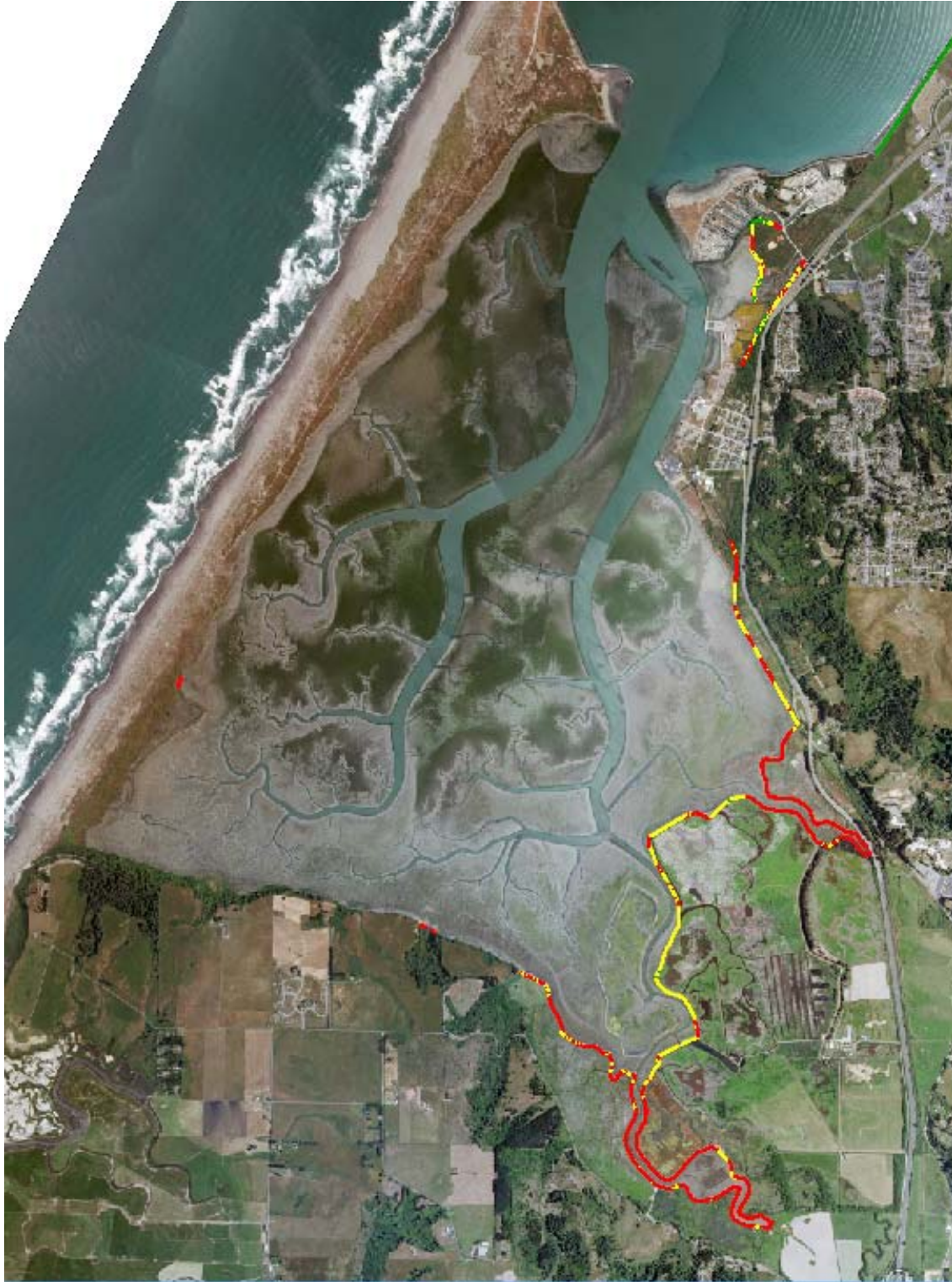
Figure 6. Diked and railroad shoreline vulnerability rating for South Bay; red high, yellow moderate, and green low.