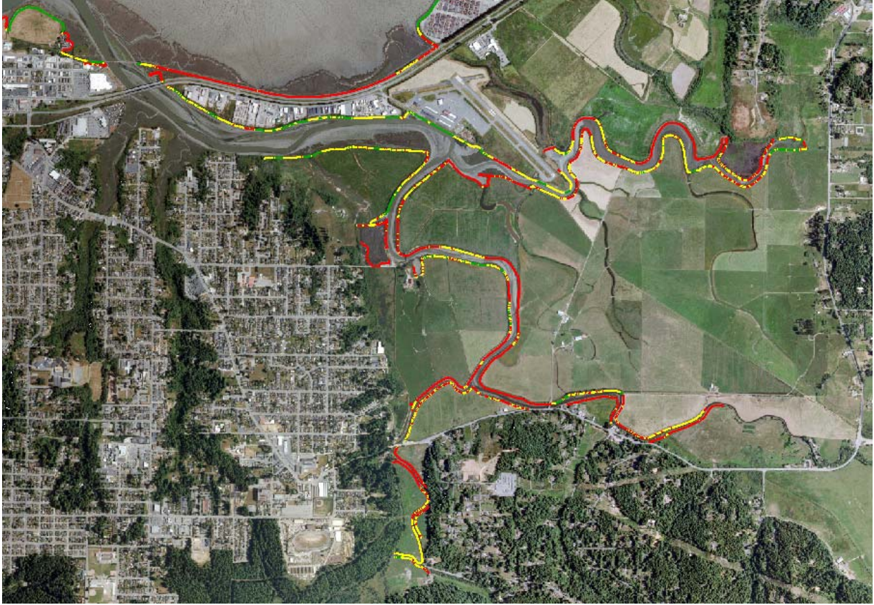
Figure 8. Diked and railroad shoreline vulnerability rating for Eureka Slough; red high, yellow moderate, and green low.