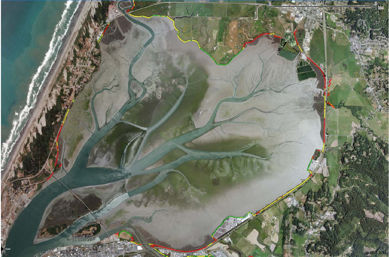
Figure 4. Diked and railroad shoreline vulnerability rating for Arcata Bay; red high, yellow moderate, and green low.