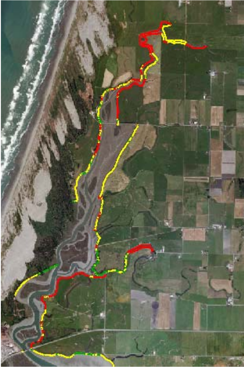
Figure 7. Diked and railroad shoreline vulnerability rating for Mad River Slough; red high, yellow moderate, and green low.